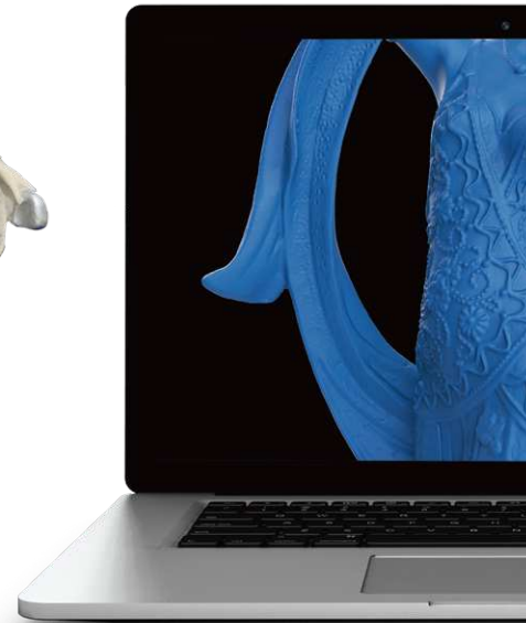
Handheld HD Scan Mode