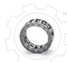
Data courtesy of Bowman - Additive Production

Statements: 9 Biocompatibility, REACH, RoHS (for EU, Bosnia-Herzegovina, China, India, Japan, Jordan, Korea, Serbia, Singapore, Turkey, Ukraine, Vietnam), PAHs, Statement of Composition for Toy Applications