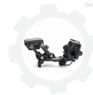
Data courtesy of Prometal3D

Statements: 9 REACH, RoHS (for EU, Bosnia-Herzegovina, China, India, Japan, Jordan, Korea, Serbia, Singapore, Turkey, Ukraine, Vietnam), PAHs, UL 94 and UL 746A