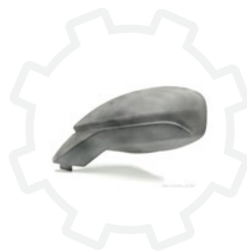
Data courtesy of Skorpion Engineering Srl