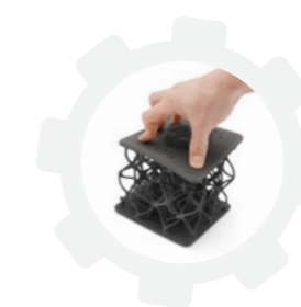
Data courtesy of HP - Lubrizol

VESTOSINT® 3D Z2773 PA 12 is the first certified material for HP Jet Fusion 3D printers. This multi-purpose, affordable thermoplastic material is ideal for the production of strong parts, enabling design of lightweight structures with great color uniformity. 13