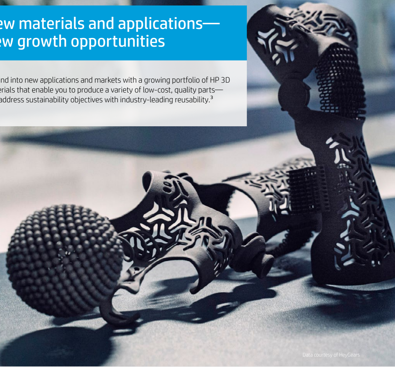
Data courtesy of HeyGears

Expand into new applications and markets with a growing portfolio of HP 3D materials that enable you to produce a variety of low-cost, quality parts—and address sustainability objectives with industry-leading reusability. 3