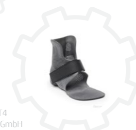
Data courtesy of OT4 Orthopädietechnik GmbH