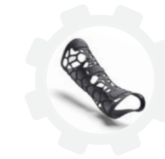
Data courtesy of Invent Medical

Statements: 9 Biocompatibility, REACH, RoHS (for EU, Bosnia-Herzegovina, China, India, Japan, Jordan, Korea, Serbia, Singapore, Turkey, Ukraine, Vietnam), PAHs, Statement of Composition for Toy Applications, UL 94 and UL 746A